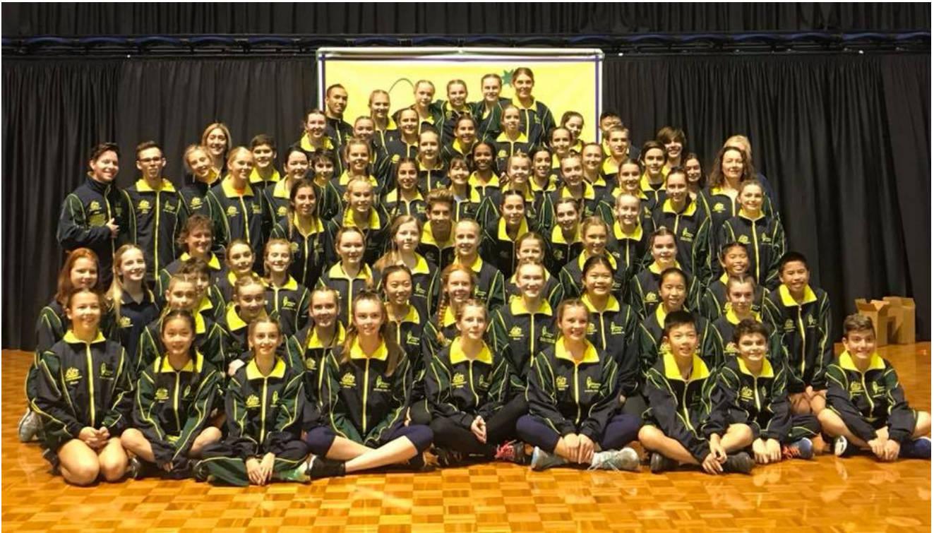
Team Australia @ 2018 Australian Rope Skipping Championships Awarding of Track Suits